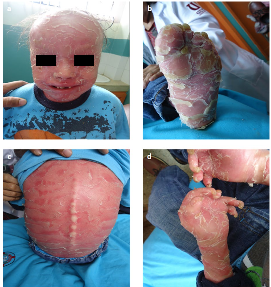
FIGURE 1 Clinical features of the patient: (a) Severe ectropion and almost complete alopecia, (b) Nail deformities and palmoplantar hyperkeratosis of the feet, (c) Patient's back showing large scales on an erythrodermic background, (d) Upper extremities severely affected. Retraction at finger joints