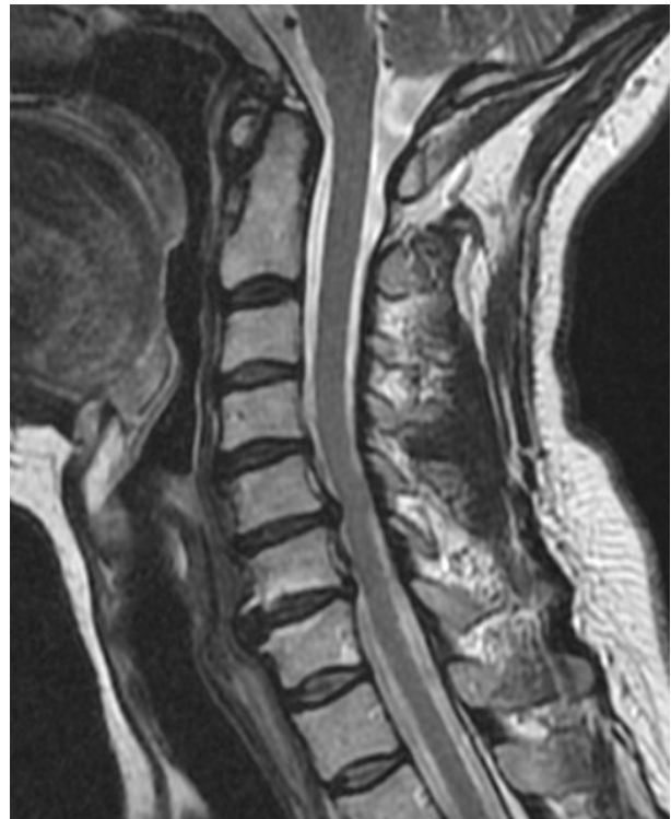
Fig 1. Sagittal section of the cervical spine in T2 MRI. Herniated disc C5-C6. Disc protrusion C6-C7.

Inclusion criteria: patients aged 18 years or over with cervicobrachialgia and clinically suspected cervical RAD attending the University Hospital Lucus Augusti (Lugo, Northwestern Spain), who had initially undergone examination by a consultant from the departments of traumatology, rehabilitation, neurosurgery, and/or neurology, and later electromyographer. Patients who had undergone MRI in high-field superconducting magnet (1.5 T) Siemens Symphony, Ge Signa HDxt and Signa Excite with Quantum gradients. Patients who had undergone EMG with concentric needle electrodes