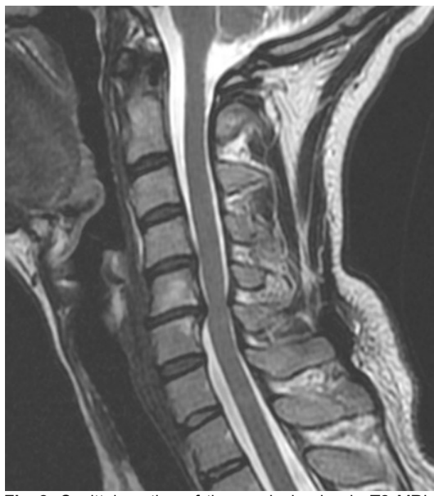
Fig 2. Sagittal section of the cervical spine in T2 MRI. Rectification. Spondylolisthesis C6-C7. Canal stenosis.

Discopathy (the sum of PROT and HD) did present with statistically significant association at the C3-C4 level, with channel stenosis (p = 0.005) and with gender (p = 0.004); at level C5-C6, with the