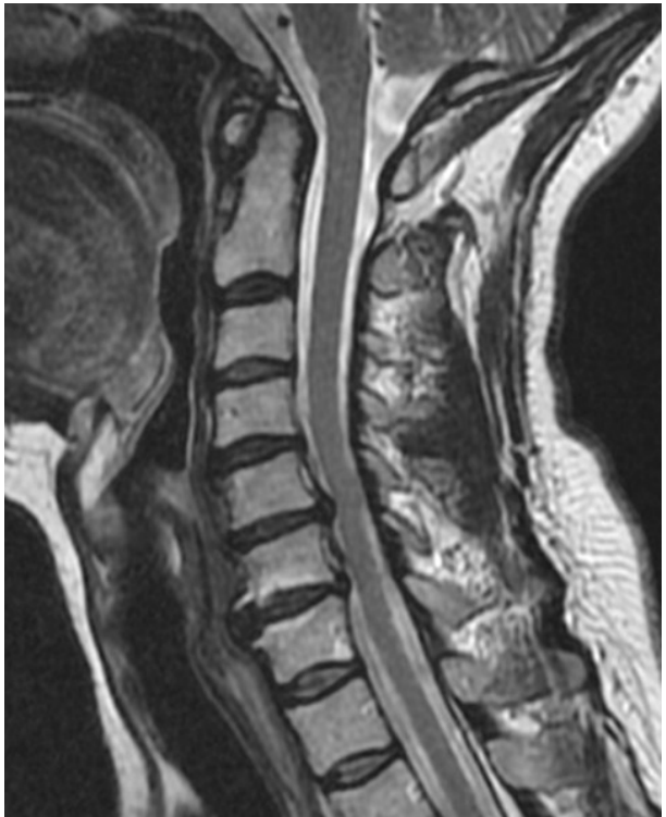
Fig 1. Sagittal section of the cervical spine in T2 MRI. Herniated disc C5-C6. Disc protrusion C6-C7.

Inclusion criteria: patients aged 18 years or over with cervicobrachialgia and clinically suspected cervical RAD attending the University Hospital Lucus Augusti (Lugo, Northwestern Spain), who had initially undergone examination by a consultant from the departments of traumatology, rehabilitation, neurosurgery, and/or neurology, and later electromyographer. Patients who had undergone MRI in high-field superconducting magnet (1.5 T) Siemens Symphony, Ge Signa HDxt and Signa Excite with Quantum gradients. Patients who had undergone EMG with concentric needle electrodes