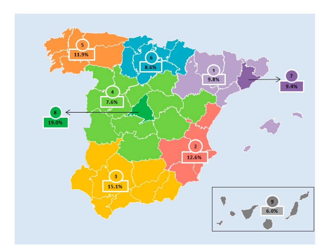
Figure 1. Nielsen geographical distribution of the sample for the EsNuPI study: Area 1 (9.8%), northeast; Area 2 (12.6%), Levant (east); Area 3 (15.1%), south; Area 4 (7.6%), central; Area 5 (11.9%), northwest; Area 6 (8.6%), north central; Area 7 (9.4%), metropolitan area of Barcelona; Area 8 (19.0%), metropolitan area of Madrid; Area 9 (6.0%), Canary Islands.

* Sample of non-vegan one- to <10-year-old children representative of the Spanish population living in urban areas. ** Booster sample of non-vegan one- to <10-year-old children who consumed adapted and fortified milk formulas and lived in urban areas.