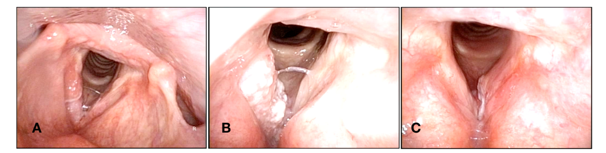
Figure 2. ( A ) Superficial lesion in the middle third of the right vocal fold. ( B ) Ulcerative-exophytic lesion involving all the right vocal fold. ( C ) Lesion affecting the anterior third of the left vocal fold. All of them were positive for malignancy and treated using CO<sub>2</sub>TOLMS.