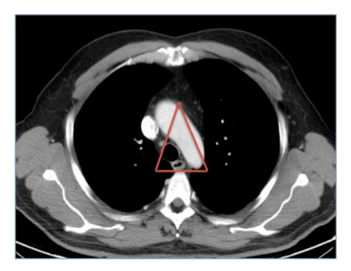
Figure 3. Mediastinal triangle in which the trachea, esophagus, and aorta are located.

is difficult to injure them except in cases of high-energy impacts. In that case, the aorta may also be damaged, since the three structures are in a "neighborhood triangle" (Figure 3).