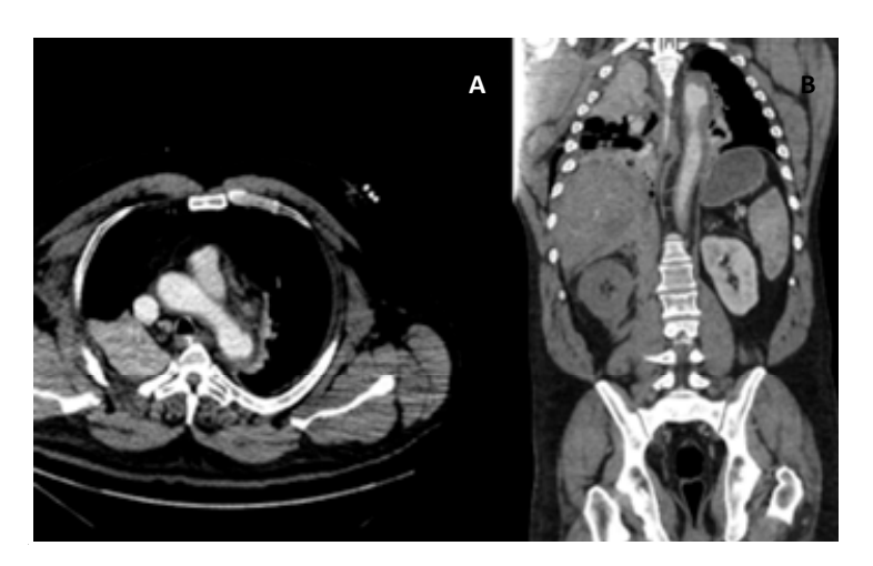
Figure 2. Collision trauma. Axial computed tomography (CT) ( A ) and coronal reconstruction ( B ) identify focal dissection and periaortic hematoma in the isthmus region.

Severe thoracic trauma can affect different structures such as the aorta, heart, vessels, etc. Several publications confirm that the aortic lesion occurs more frequently at the level of the isthmus [2,5,18] (Figure 2).